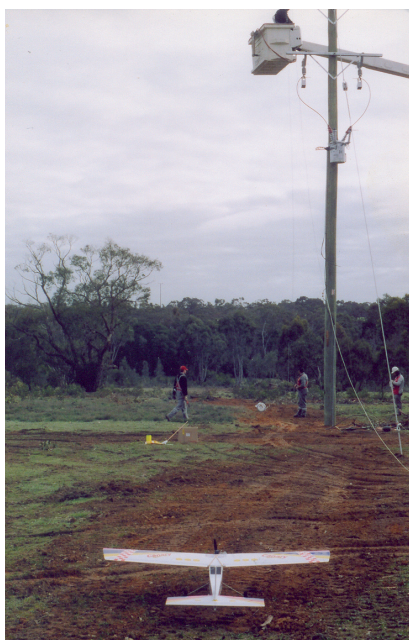
PowerCor Site - Otways 800 metre flight